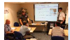
Training and Consultancy