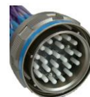
Optical and Electrical Harnesses